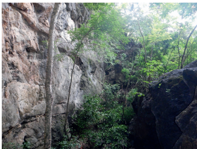
FIG. 3. Tropical deciduous forest at the type locality in Omitlán, municipality of Juan R. Escudero, Guerrero, Mexico.

Dorsal and lateral body surfaces covered by numerous scales of varying shapes and sizes; dorsal surface with numerous slightly enlarged, weakly keeled tubercles ( \sim 3\times adjacent mid-dorsal scales); 28 enlarged tubercles along paravertebrals between axilla and groin.