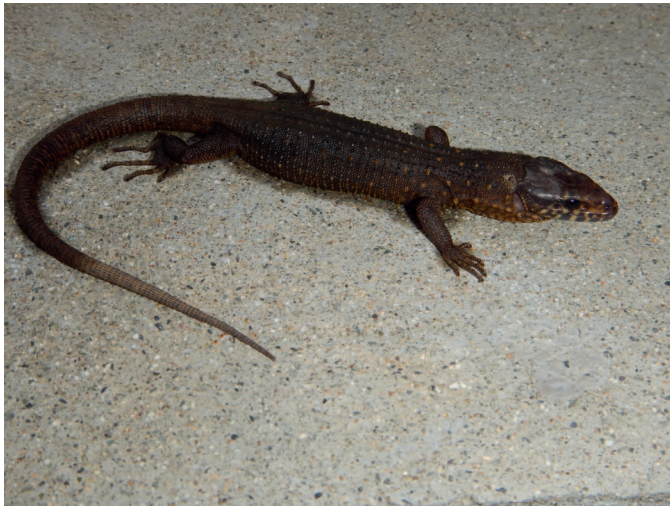
FIG. 1. Adult female specimen of Lepidophyma inagoi in life (MZFC 30706, holotype).

Potrero Oriental (17.163764°N, 99.5038723°W), elevation 670 m; MZFC 30712, adult male from Garrapatas, municipality of Juan R. Escudero (17.19467°N, 99.52°W), elevation 523 m; MZFC 31979, an adult female from Palo Gordo, municipality of Juan R. Escudero, Guerrero, Mexico (17.1536°N, 99.5461°W), elevation 245 m.