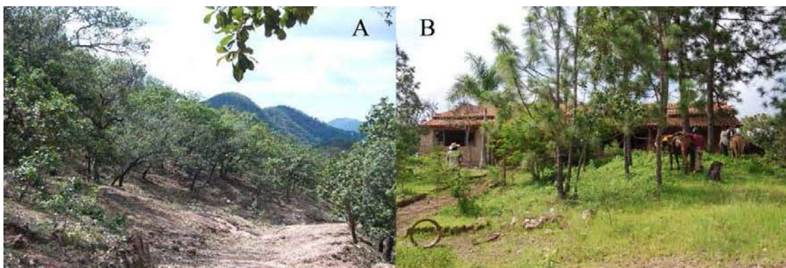
Figure 1. Cerro del Pirame, La Guásima, Concordia: A, mesa covered by oak forest; B, stand of pine trees ( Pinus oocarpa ) where the 2 live specimens of Crotalus stejnegeri were found.

Based on our current knowledge, all 3 species of long-tailed rattlesnakes occupy small geographic areas, although