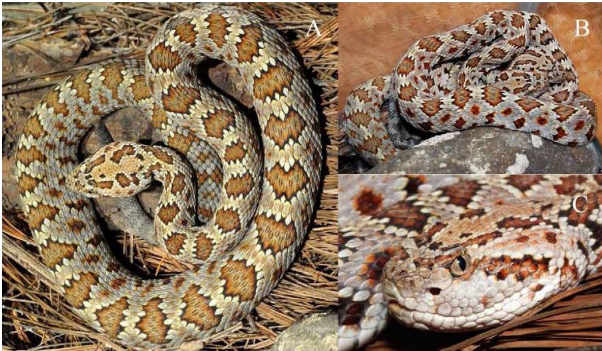
Figure 2. Crotalus stejnegeri : live female, 79.0 cm TL, from Cerro del Pirame, La Guásima, Concordia, Sinaloa: A, specimen in toto ; B, orange-brown coloration after shedding skin; C, laterodorsal view of head showing 6 prefoveals.

Reyes-Velasco et al. (2010) suggest that their ranges must be far greater than presently understood. These authors offer several explanations in support of their statement, including the presence of illegal narcotics activity and the scarcity of accessible roads, which are nearly impossible to use during the rainy season. They also list anthropogenic factors potentially affecting the habitat of C. lannomi such as agriculture, cattle grazing, logging, and mining. All of the above explanations and factors are also applicable to the tropical dry forests covering the southern highlands of Sinaloa, and we feel that the presence of C. stejnegeri in southern Sinaloa and the neighboring states of Durango and Nayarit is probably greatly underestimated. It should be pointed out that many of the comuneros of La Guásima are familiar with this peculiar species of rattlesnake which they call “vibora sorda”, and it is considered a secretive, rarely observed species that does not grow very large (less than 1 m long).